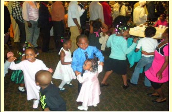
PCI kids dancing for joy @ the 5th Anniversary dinner reception