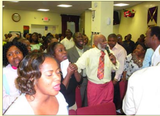
Worshippers from the 5th Anniversary Celebration